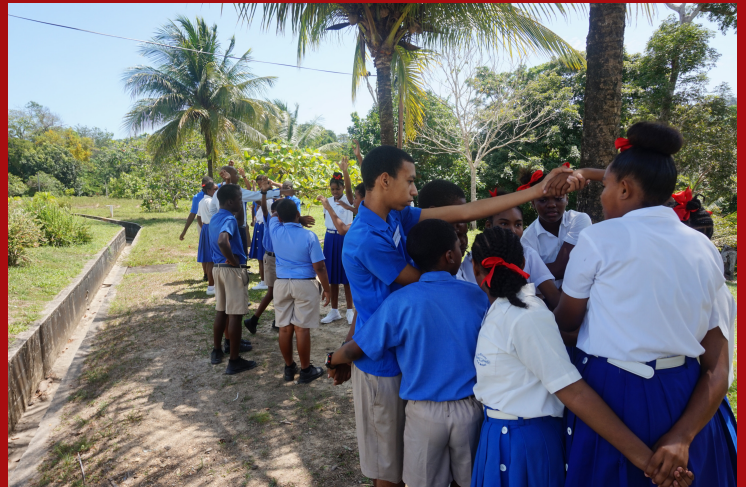
La Fillette RC Primary School

We widened our reach as we partnered with the Ministry of Education for the S.T.R.E.A.M. (Science, Technology Research Engineering Arts and Mathematics) Fairs with post-SEA students from over 40 schools across Trinidad in June 2019.