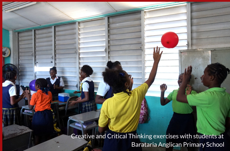
Creative and Critical Thinking exercises with students at Barataria Anglican Primary School